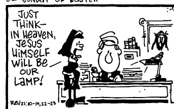
6TH SUNDAY OF EASTER